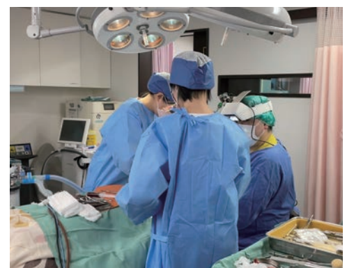
Fig.5 | Enhancing surgical lighting environment through integration of OPELA III with older model halogen ceiling-mounted surgical lights.

Having spent three decades refining bone structures, I acknowledge considerable improvement in my competence level over time, yet I persist in honing my skills. I aim to conduct surgeries with a mindset of continuous improvement, meticulously attending to even the unseen elements. I actively endorse tools that facilitate this goal. Cosmetic surgeons aspiring for excellence with such determination should undoubtedly consider giving OPELA III a try (Fig.4).