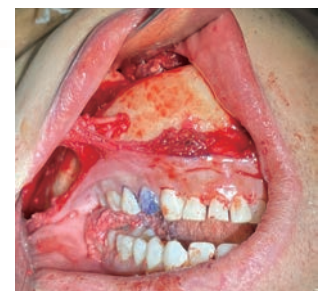
Fig.2 | Vivid contrasts of colors and shades allow to easily distinguish various tissues.

visibility of even the finest details of the mandibular angle when viewed from the usually obscure underside. The protrusions and curves of bones appear more graphic, enhancing visual recognition. Additionally, during reduction of mandibular bone, the course of the inferior alveolar nerve becomes a significant concern. While I preserve the nerve by